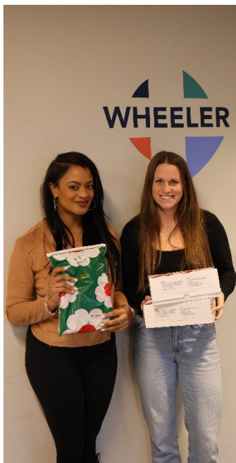
Example of employee engagement opportunities: Lucas Oil, one of our incredible sponsors, brought lunch to the Center for Women and Children for all of the staff, donated kids' socks for the Santa Shop, and served lunch to our guests.

100% of your sponsorship goes to Wheeler Mission and will make an immediate impact. Wheeler Mission provides safe shelter, nutritious food, and important care to men, women, and children who are experiencing homelessness.