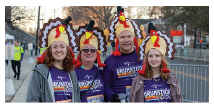
Drumstick Dash , a family fun/run on Thanksgiving morning, celebrated its 20th year

Strength In Our Streets is a one-day team fitness competition. In 2022, we had 38 teams (456 individuals) compete in our 9<sup>th</sup> annual event at Park Tudor School and raised a record $367,718 while raising awareness for our programs.