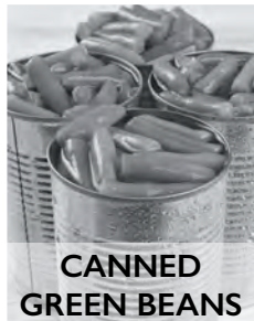
CANNED GREEN BEANS